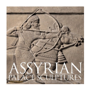
Assyrian Palace Sculptures